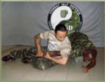
Learn the most comprehensive Reality Based Street Self Defence

To fulfil personal goal, to meet a challenge or to learn to just survive in the streets Join the World's Premier Brand Reality Based Self Defense Group for your personal security, survival & fitness and protect your friends, family & loved ones.